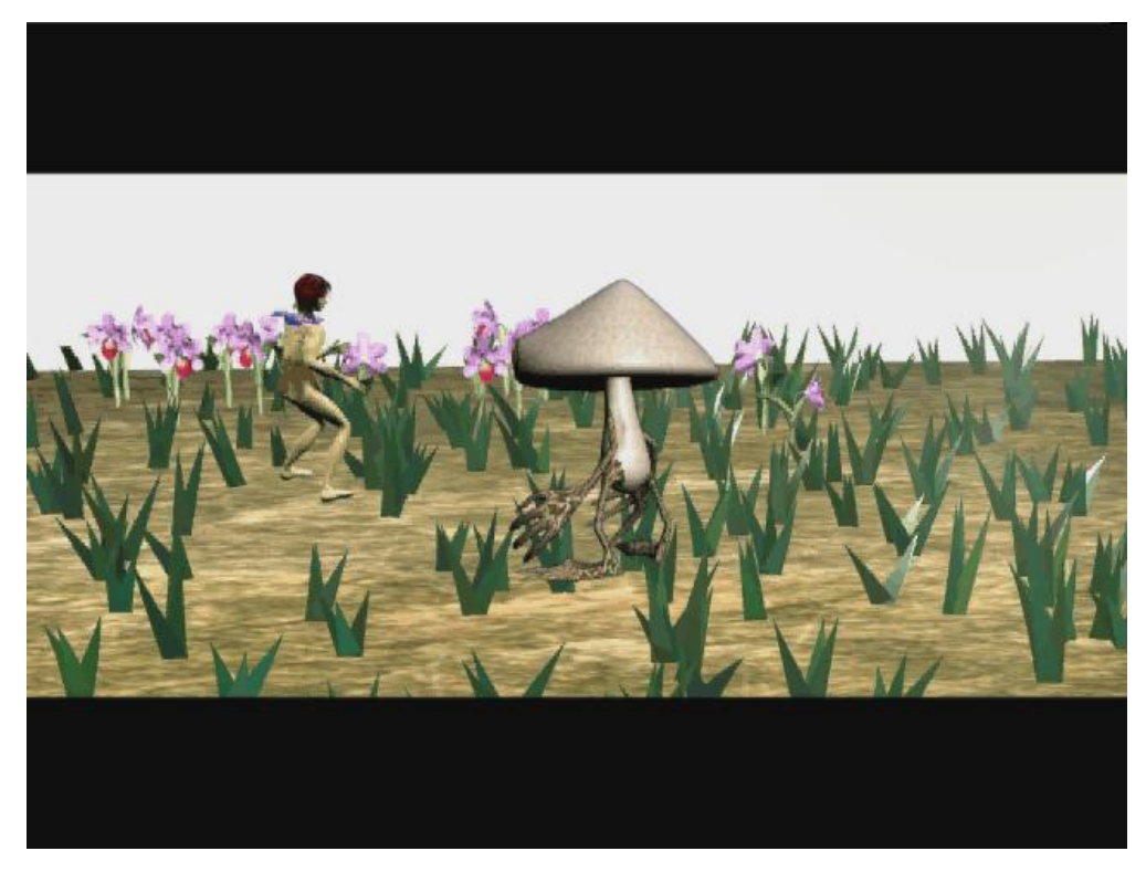
Figure 3: Game Interface 2