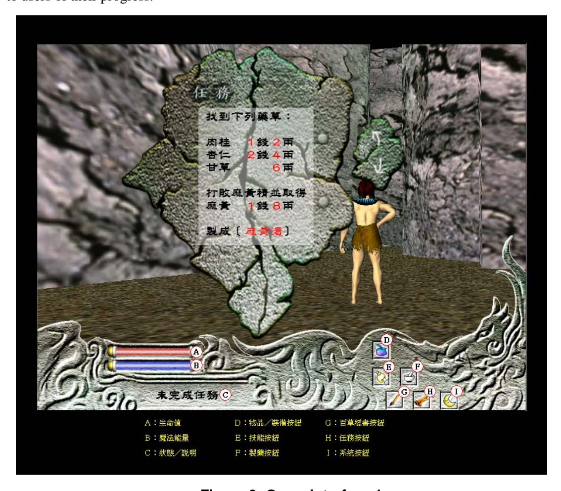
Figure 2: Game Interface 1

As the game progresses, the players repeatedly encounter these herbs. They must be very familiar with the herbs' respective effects and functions so they can apply it whenever it is appropriate in the tasks. As Schwen, Kalman, Hara, and Kisling (1998) refer to learning as a process of acquiring knowledge, these Chinese herbal medicinal, prescriptions, stories, and knowledge are embedded in the characters and tools. Other than that, in each stage, there is one big monster, such as Ephedra, Dragora, Ginsengia, Mo-White, and Queen NuWa (see Figure 3), and a few small monsters such as Almondia, Cinnamomia, Glycyrrhizia, and poisonous snakes. Spread out in the journey, there are also treasures, such as map, medical guide, red lash, Yun Nan White, etc.; and ploys, such as tharm-cutting grass, Chinese Soapberry Seed, and Chloranthi Serrati Radix, etc. Such design is to require users to apply their learned skills. When correct prescriptions are made, players game the pass to go the next stage, otherwise, their life power got deducted as they failed to make distinctions or over the challenges, as the system offers appropriate feedbacks to users of their progress.